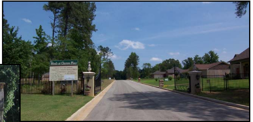
THE WOODS AT CLAYTON PLACE